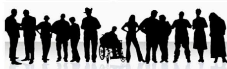
MARCH PRE-CONFERENCE ASSEMBLY 2025 Presented by the Northern Districts 2, 3, 4, 11, 12, 19, 24, 42, 46