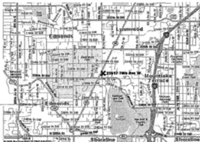
Created with Print2PDF. To remove this line, buy a license at: http://www.software602.com/

Sno-King Intergroup's business meeting is the 2 nd Tuesday each month at the Intergroup office.